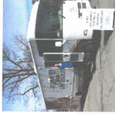
Beaver Valley ICU Mobile Clinic, Choices Pregnancy Services